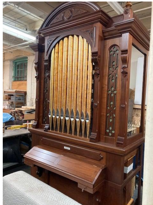
Hook and Hastings Organ

Manual: Viola Diapason 8' Gedeckt 8' Principal 4' Fifteenth 2'