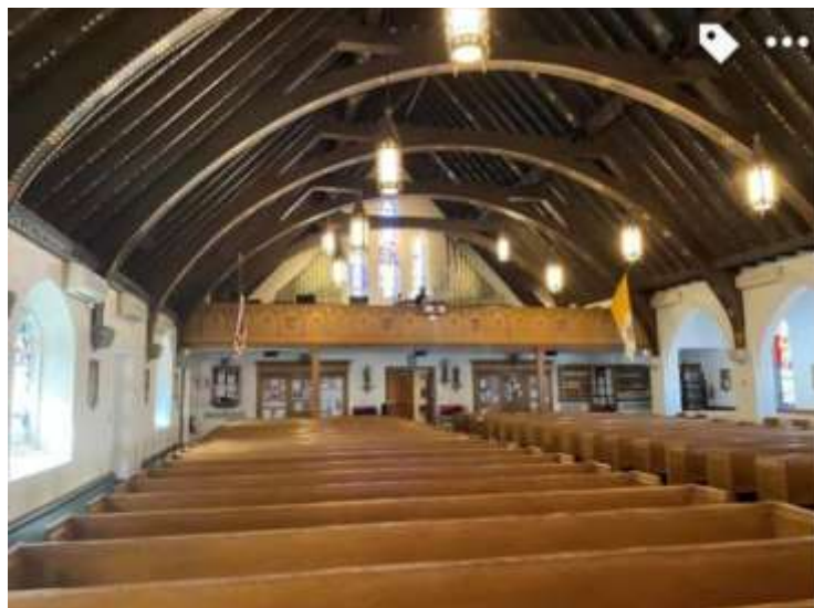
Facing the back of the Catholic Cadet Chapel.

Our small convoy took a swing around Eisenhower Hall, the marvelous performance hall, driving under it by the box office and emerging just as a train came south and proceeded into a tunnel under the buildings. We viewed North Dock and South Dock, and then cars departed, all going to see more that we had passed, or other areas of interest.