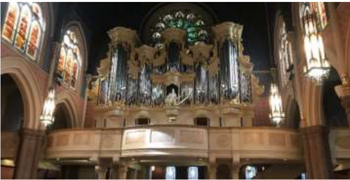
Craighead-Saunders Organ.