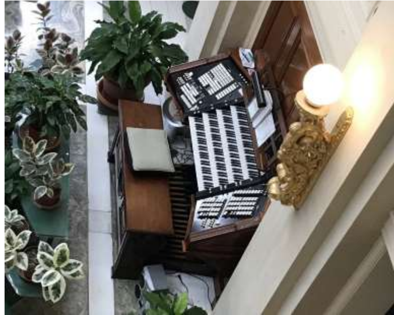
Organ console in Eastman House Conservatory.