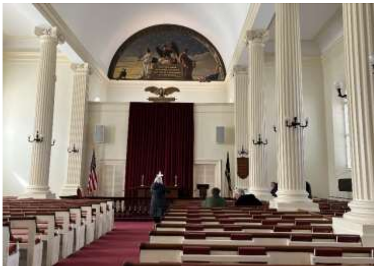
Old Cadet Chapel with Trompe l'oeil painting over the altar.