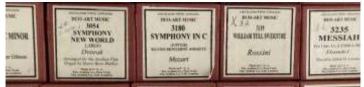
Roll-player rolls at the Eastman House.