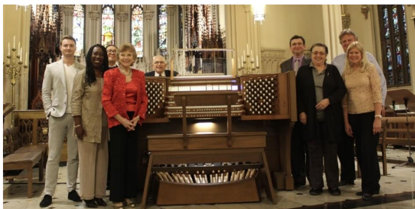
Participants in Transcriptions Concert.

Members of NAGO were invited to participate in a Transcriptions recital by the Suffolk Chapter, at our Cathedral in Garden City on 15 October.