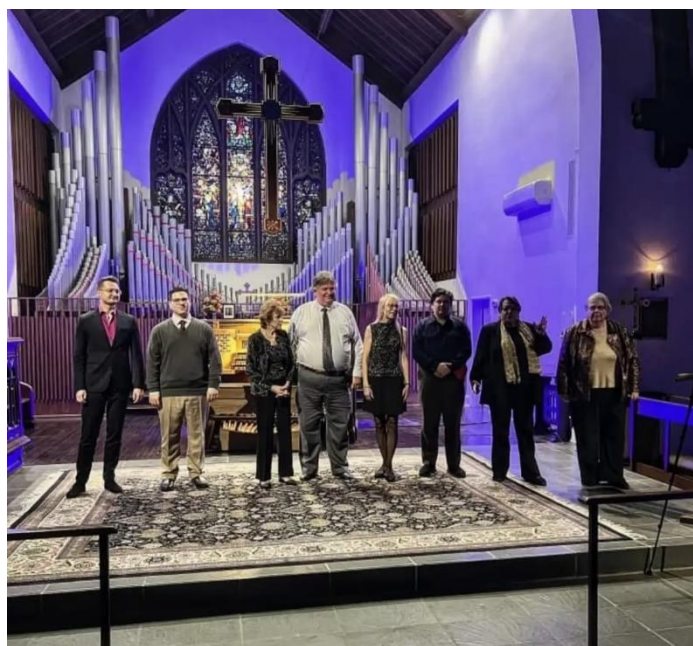
Participants in Concert of Spooky Halloween Music.