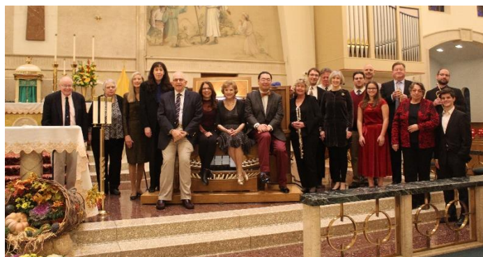
Group picture of participants in the “Organ and...” concert.