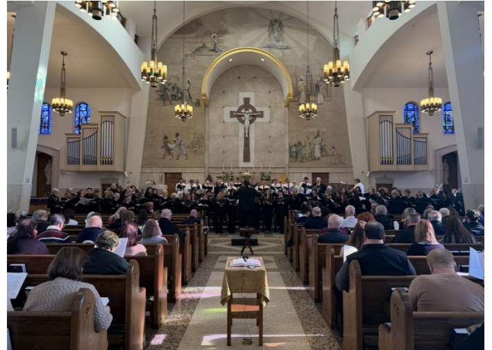
The choir for the hymnfest and the audience.

The Church of St. Patrick in Huntington was the site of a truly monumental FESTIVAL OF HYMNS on Sunday, March 2. This event was co-sponsored by the Nassau and Suffolk Chapters of the AGO.