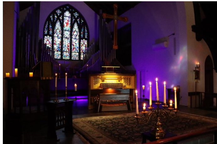
A spooky atmosphere for the concert!

Walking through the church graveyard on the chilly, gray afternoon of October 26th certainly helped to set one's mind for a "Spooky Organ Recital". The church was semi-dark, lit by candles, which increased the anticipation.