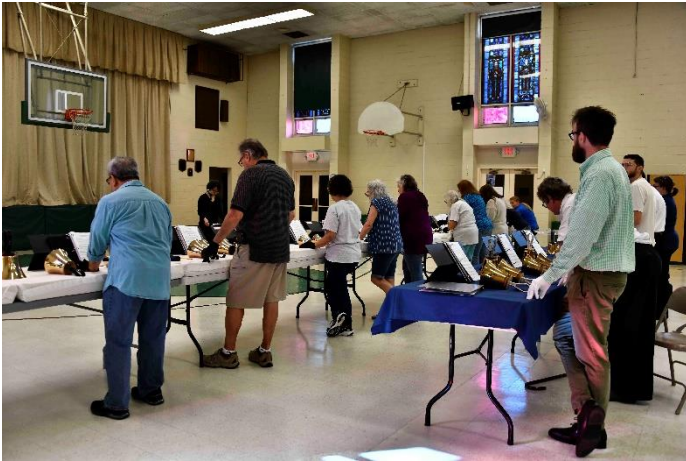
Participants at the handbell workshop.